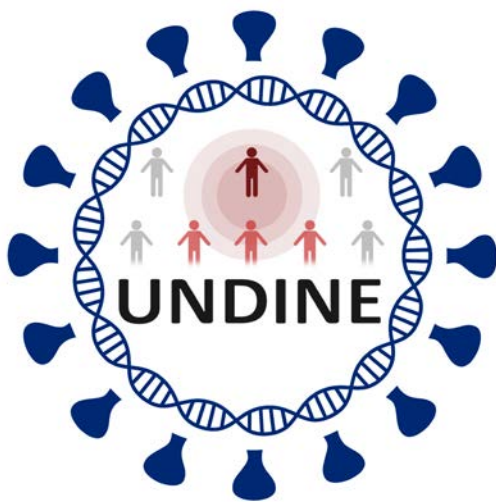
Figure 1. Logo of the UNDINE project , created after suggestions from various beneficiaries. It will be used as a future identity label on documents, website appearances and public outreach activities.

One of the first task of WP8 (Management) has been to develop a visual identity with a project logo and supportive templates within the 1-3 months. This visual identity is intended to support coherent and recognizable communications among beneficiaries and between the consortium and the public. The UNDINE-logo (Fig. 1) is further designed to brand the project and to be recognisable on any online appearance, in particular on the newly created project website. A draft of the logo was first created after the suggestions of several beneficiaries and later sent around in the consortium for approval.